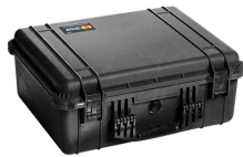
1550NF No Foam